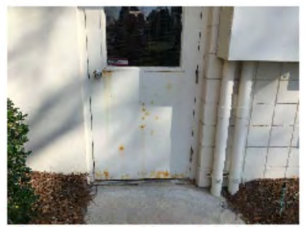
Oxidation of exterior steel doors on the South elevation