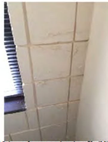
Moisture damage on interior of building

Existing Structural Conditions Photo Essay