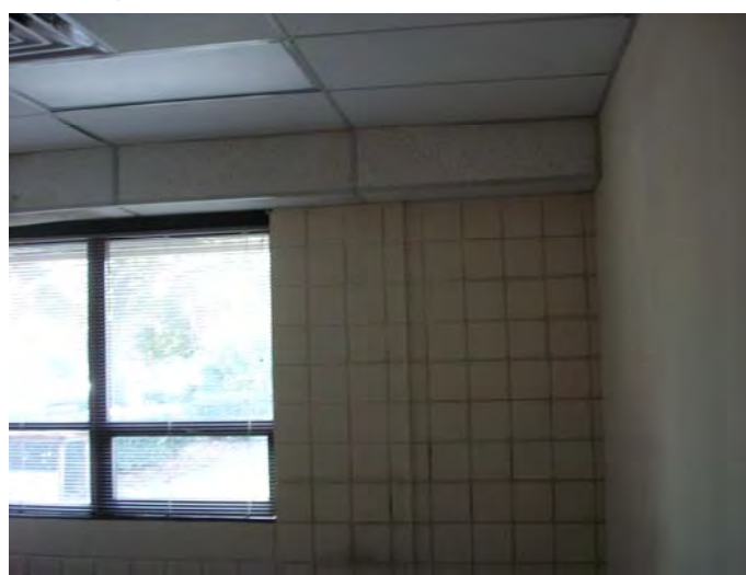
Block Wall and Typical Fenestration