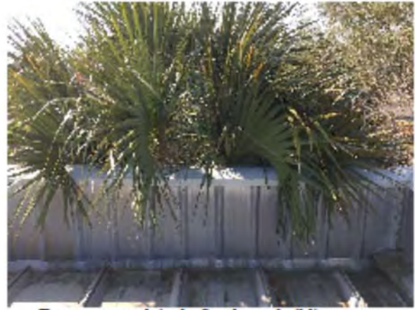
Tree overgrowth in the Southwest building corner