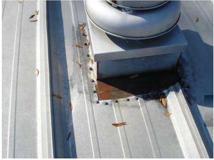
Existing Roof Penetrations