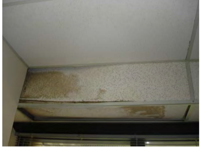
Existing Water Damage