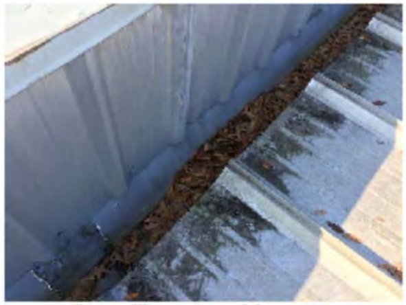
Leaves filling gutters and downspouts