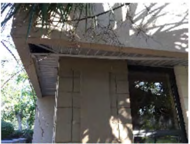
Typical damage to soffits in southwest building corner