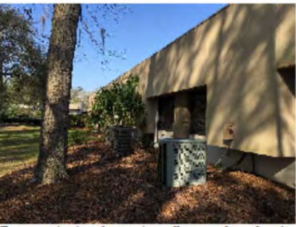
Trees growing into the exterior walls on southern elevation