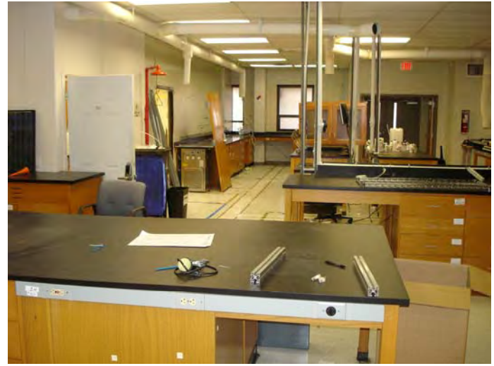
Existing Lab Space