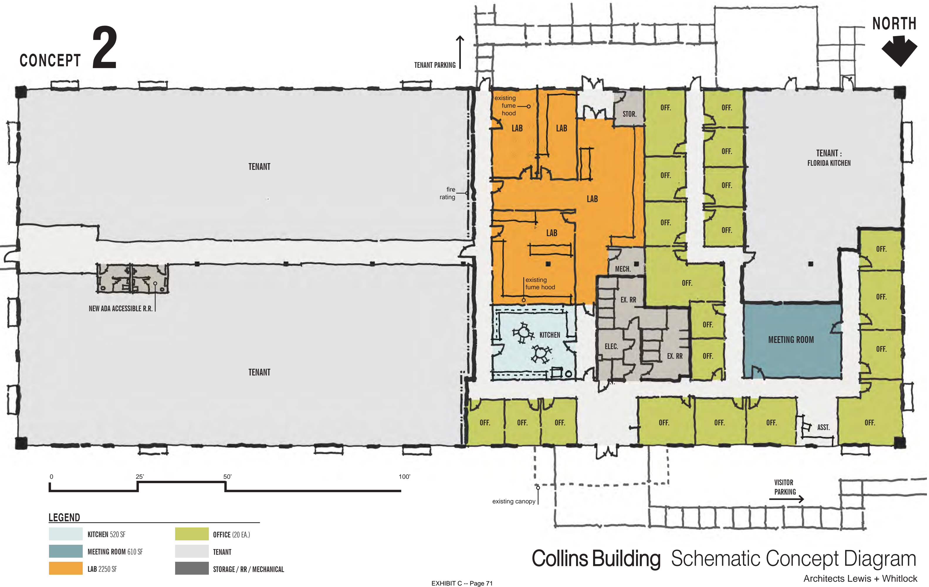
Architects Lewis + Whitlock