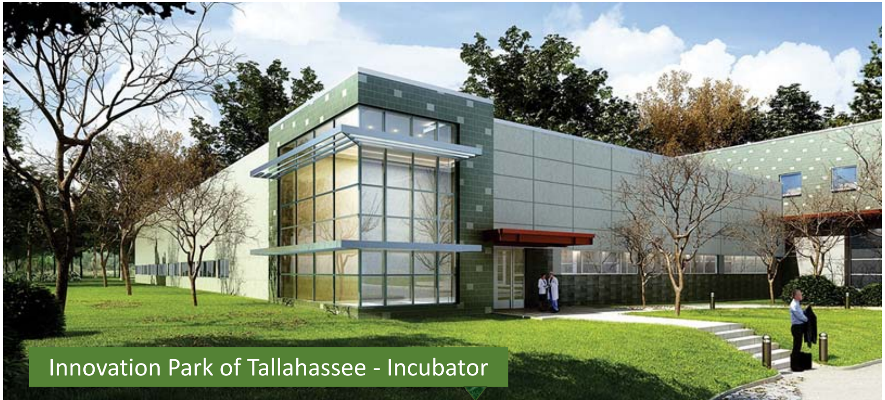
Innovation Park of Tallahassee - Incubator